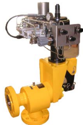
Angle Bracket Hydraulic 4C